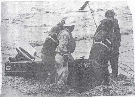
National Guardsmen and a sheriff's deputy prepare to patrol flooded areas around Alton. Night-long patrols were maintained